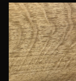
Natural White Oak